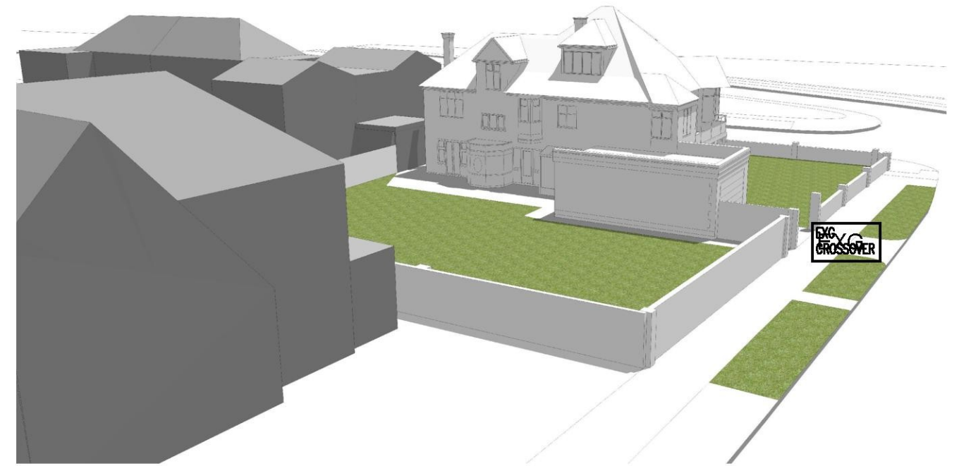
EXISTING MASSING (2)