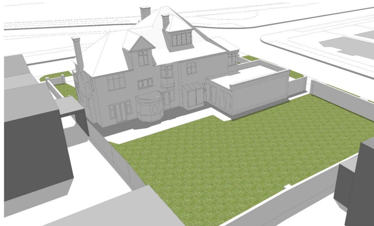
EXISTING MASSING (3)